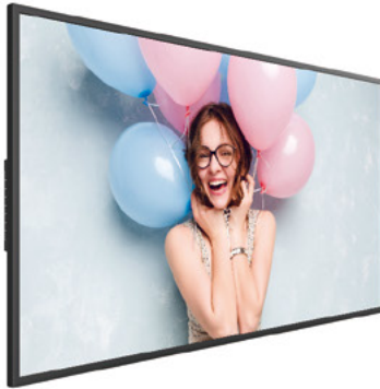
PU55A / PU65A